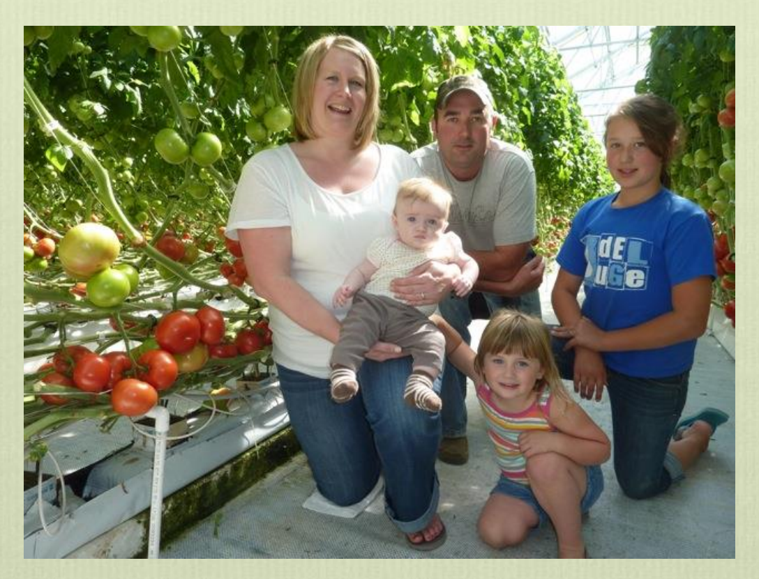
Greenhouse Business Experiences CEAC 2013